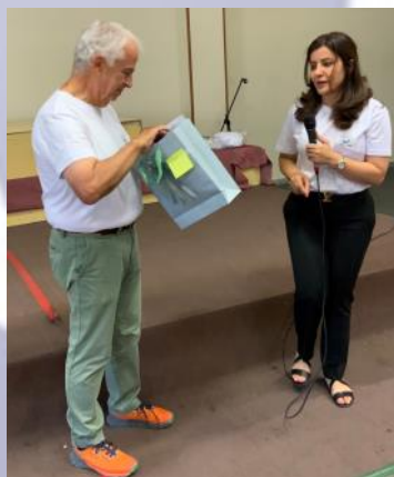
Gifts for the departing teachers