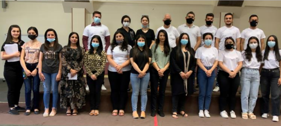
Teachers and Staff for 2020-2021