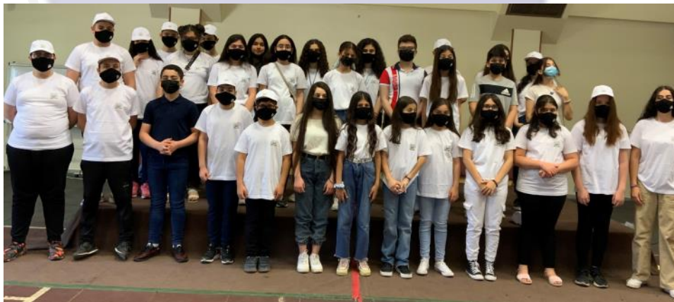
MQI Students of the Year 2020-2021